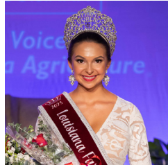
FARM BUREAU QUEEN 2023-2024

QUEEN'S CONTEST • TALENT CONTEST • TALK MEET CONTEST