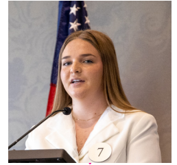
TALK MEET CONTEST WINNER 2023